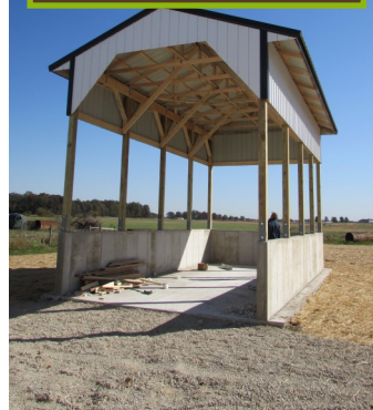
Animal Waste Facility