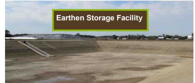
Earthen Storage Facility